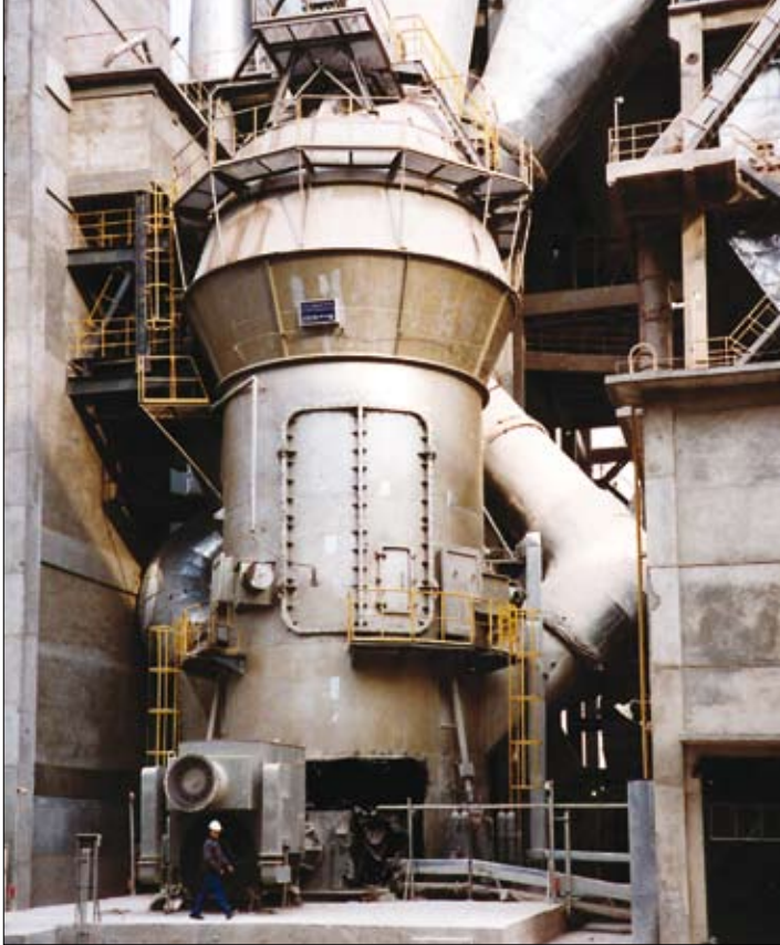
Atox mill easy to fit into a constricted space.

Segmentation of wear parts means low risk of cracking, therefore extremely wear resistant wear parts for both roller and table can be used. Further, the segmented wear parts are suitable for hardfacing.